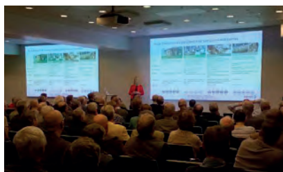
Valmet was presenting for private investors at Rahapäivä event in September 2015 arranged by Arvopaperi.