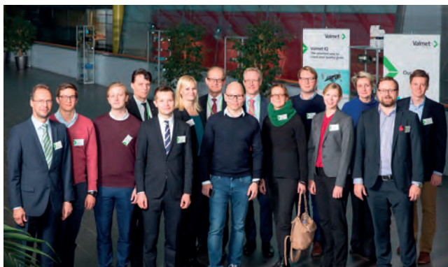
Valmet's site visit to Tampere was arranged in November 2015 and focused on automation business.