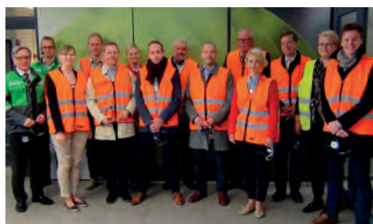
Valmet's site visit to Jyväskylä, Finland in June 2015 focused on Valmet's board and paper business.