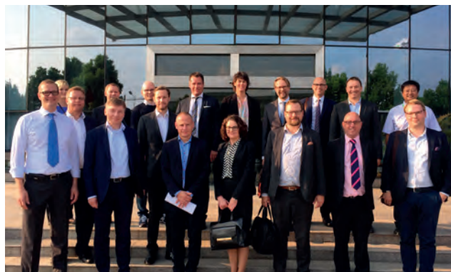
Site visit to Shanghai, China in September 2015 was focused on Valmet's operations and market in China.