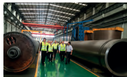
Investor and analyst group was introduced to Valmet site at Jiading in September 2015.

events at Valmet headquarters in Keilasatama, via a live webcast on Valmet's investor website, a conference call or via Twitter. For the Interim Review published on July 30, Valmet arranged a conference call, and it was also possible to follow the call via a live audiocast on Valmet's investor website. Recordings and transcripts of these events are available on Valmet's investor website.