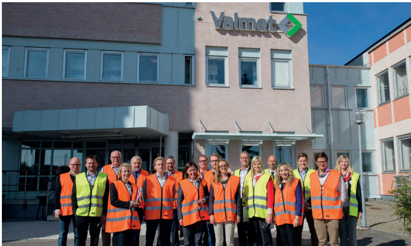
Valmet's pulp-themed site visit to Sundsvall, Sweden in September 2015.